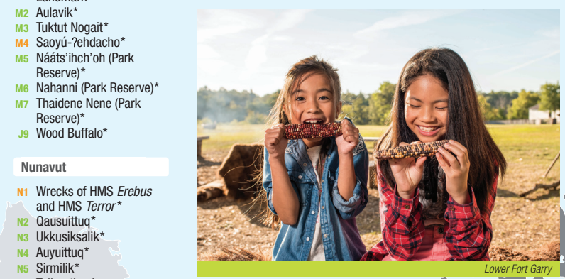
Lower Fort Garry