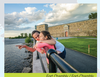
Fort Chambly / Fort-Chambly

Que vous soyez à la recherche d'aventures, d'activités scientifiques amusantes pour la famille ou d'un petit coin de paradis pour la nuit, Parcs Canada a une panoplie d'expériences à vous offrir.