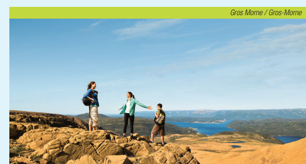
Gros Morne / Gros-Morne