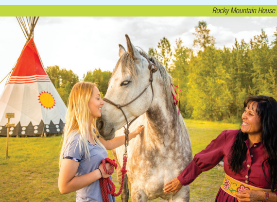
Rocky Mountain House

* Certain conditions or additional fees may apply for this site, please call ahead or visit our website for more information.